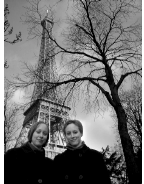
The smiles say it all!

When asked when they would be returning to Paris, Ashley replies wistfully and with a smile, “Tomorrow!”