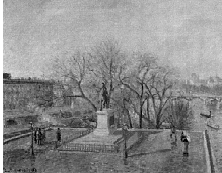
Le Pont Neuf: A Winter Morning, Camille Pissarro.